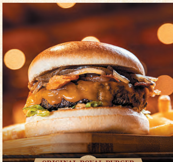
ORIGINAL ROYAL BURGER